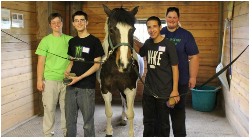
Students from Facing History New Tech High School