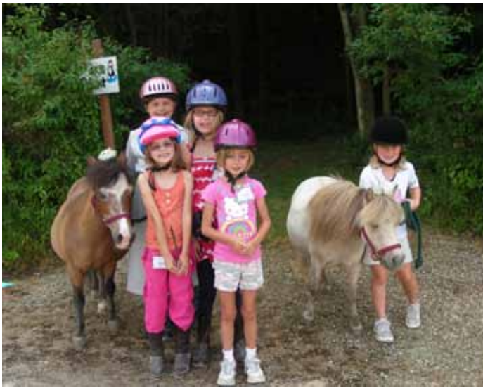
Summer campers take miniature horses Sonny and Willy on a trail walk

"Best place on earth for special families!"